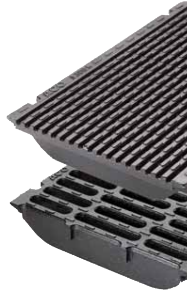
Slotted ductile iron Class F