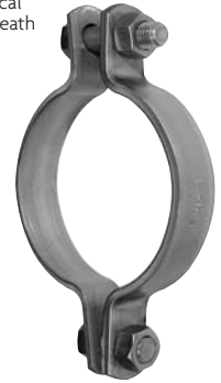
FIG. 212: LOADS (LBS) • WEIGHT (LBS) • DIMENSIONS (IN)