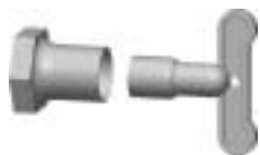
Lock Shield Loose Key Add Prefix "S"