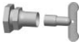
Stuffing Box Lock Shield Loose Key Add Prefix "ST"