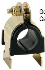
Gold Electro-Galvanized Steel