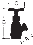
710* BOILER DRAIN (male IPS to hose)