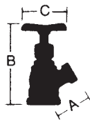
712* BOILER DRAIN (female IPS to hose)