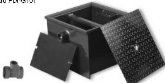
Flow Control for Series 800-801