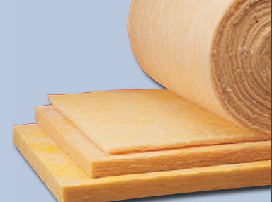
HTB 26 Spin-Glas® Fiber Glass Blanket Insulation