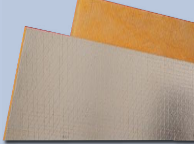
800 Series Spin-Glas® Fiber Glass Duct and Equipment Insulation