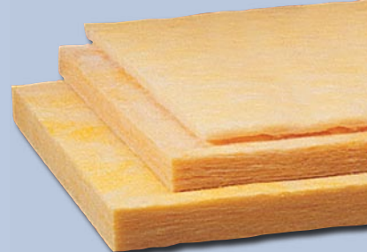
Spin-Glas® Fiber Glass Board Insulation