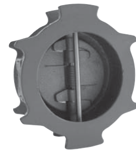
KW-900-W Wafer Style 2½" - 12"