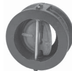
KW-900-W Wafer Style 14" - 16"

NOTE: Twin Disc Check Valves can be installed horizontally or in the vertical position with flow up.