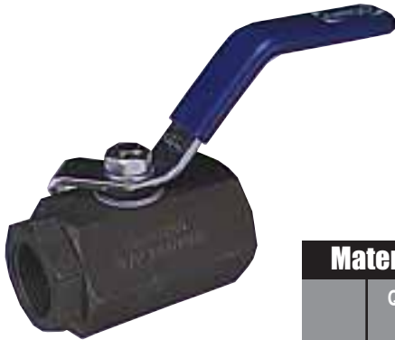
T580-CS-R-66 Stainless Steel Trim T580-CS-R-25 Carbon Steel Trim

Two Piece, Threaded, Carbon Steel body, PTFE Seats, Carbon & Stainless Trim, 2000 psi CWP